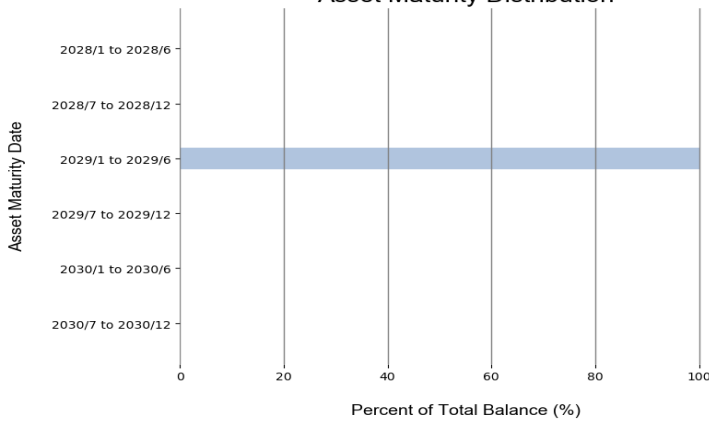
Asset Maturity Distribution

There is one single asset in the pool with the maturity date in February 2029.